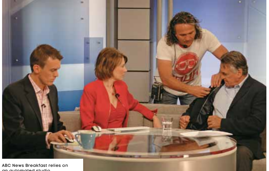
ABC News Breakfast relies on an automated studio