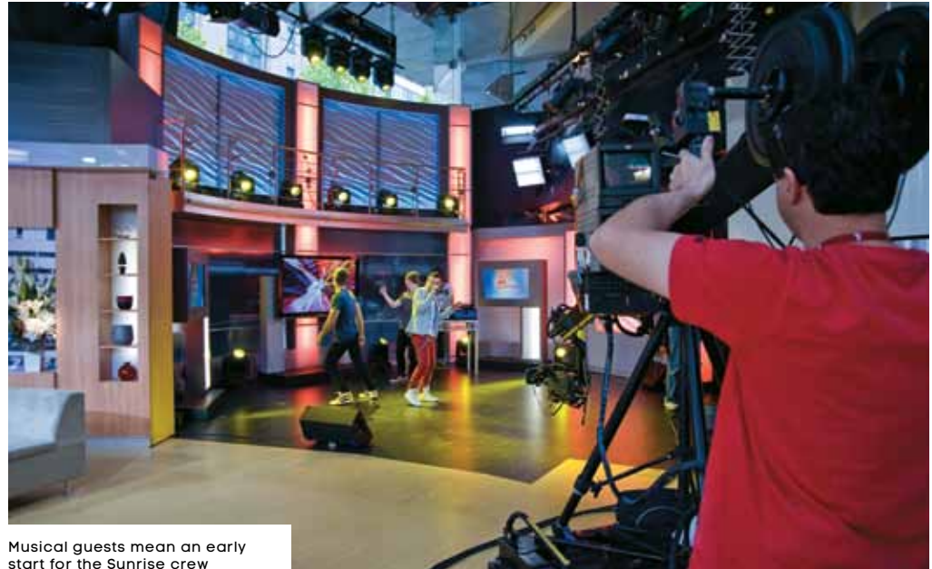
Musical guests mean an early start for the Sunrise crew